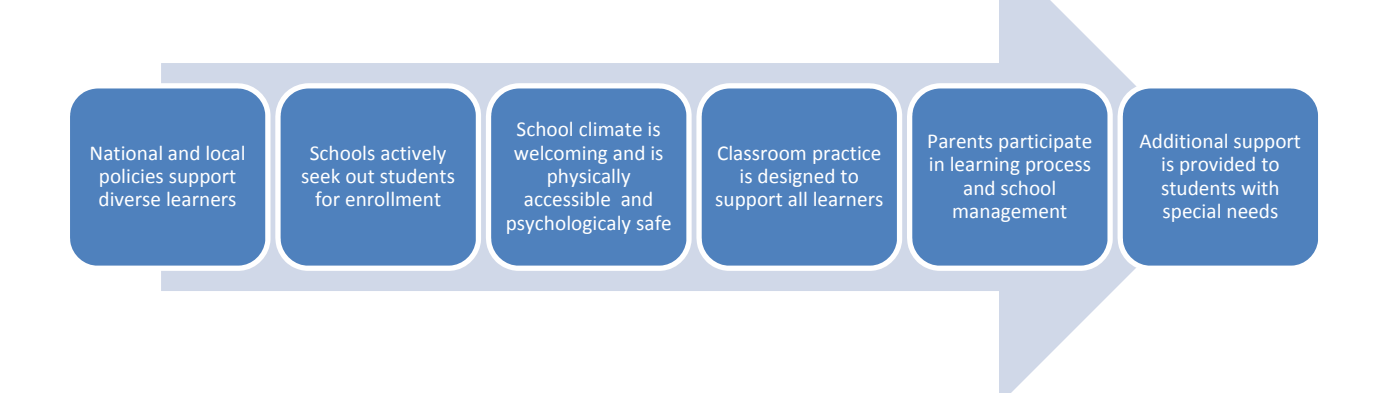
Diagram 1: Inclusive Education Process

Diagram 1 (below) outlines the necessary steps to help a child access her or his educational rights and participate in a high-quality program. This diagram is not an exhaustive list of elements needed for inclusive education, but it provides a general outline and illustration of the multiple layers of stakeholder support needed to create inclusive, child-friendly schools.